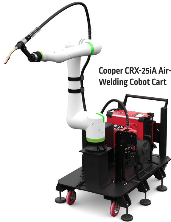
Cooper CRX-25iA Air-Cooled Welding Cobot Cart