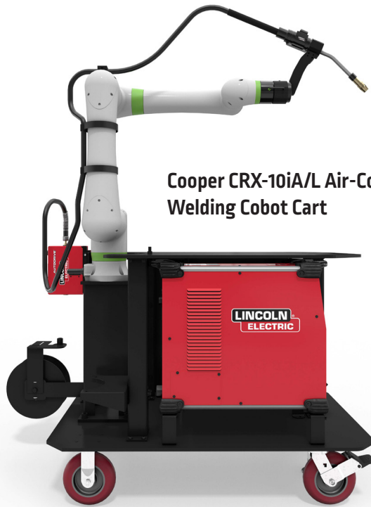
Cooper CRX-10iA/L Air-Cooled Welding Cobot Cart